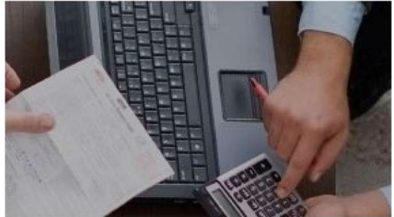
Customer Story: Quicken

Efficiencies gained through the system and easy integrations with third-party applications like Bill.com allow Quicken to operate with a much smaller accounting team than similar-size businesses, with the flexibility to accommodate complex revenue recognition processes for different product lines.